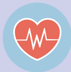
Health and wellness