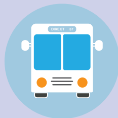
Travel and transport