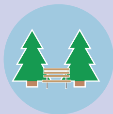
Places to go, things to do