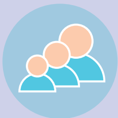
Preparing for adulthood