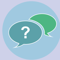
Information and support