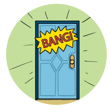
We might not like loud noises.