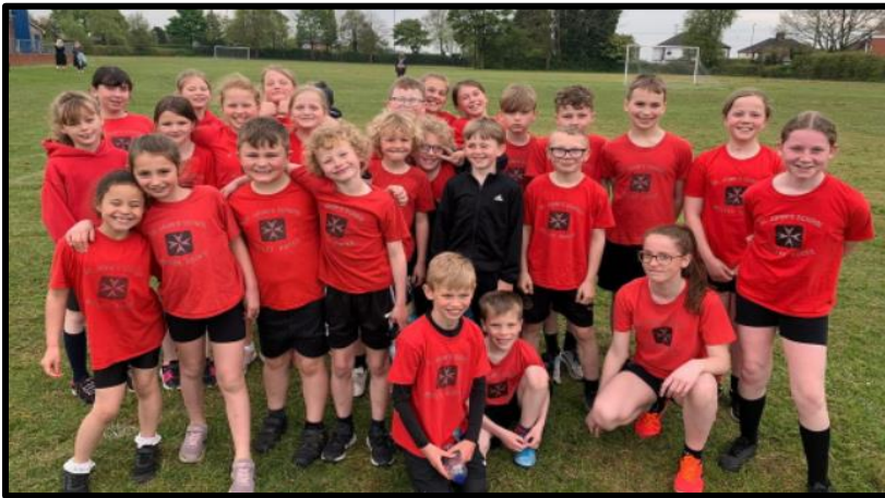
Well done to the Year 3 girls' team and the Year 4 boy's who have qualified for the next round at Keele.

A massive well done to the pupils who took part in the recent cross county event at Moorside High School. Competitive sport has been off the agenda over the last few years due to Covid, so this was a new experience for some of our pupils.