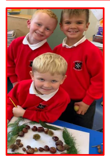
Year 2 have been out and about collecting objects to explore composition.

We're making greater use of our grounds during playtimes using the Crinkle Crag climbing frame and our new child led 'loose parts play' equipment.