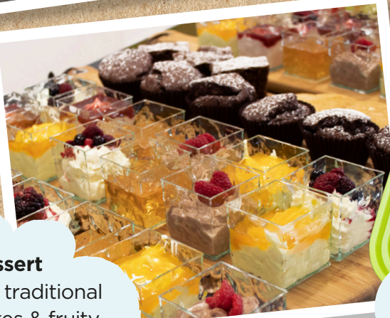
Dessert Choice of traditional puds, cakes & fruity desserts