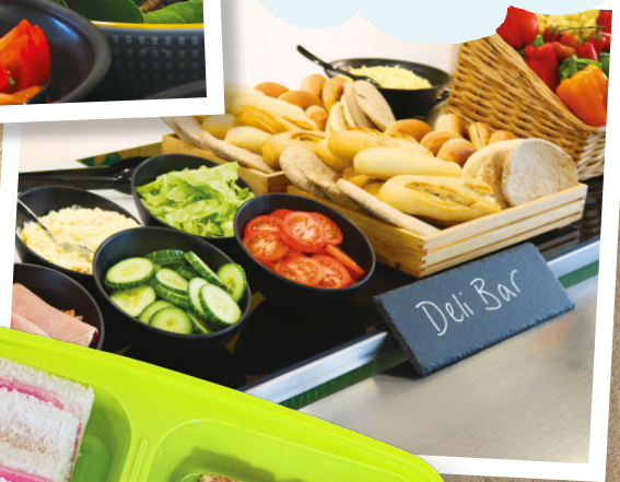
Deli Bar Selection of Breads & Fillings