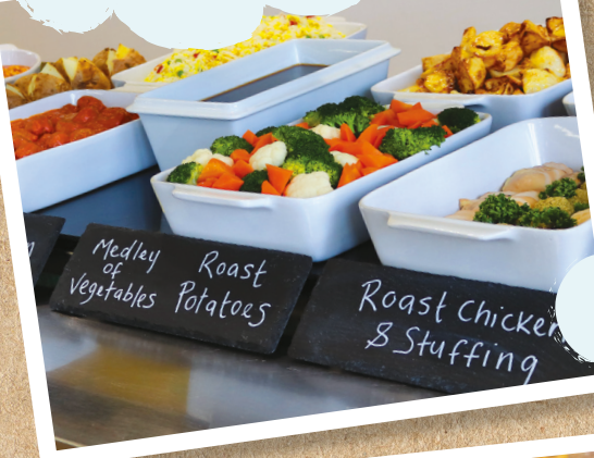
Main Hot Meal Variety of meat & vegetarian dishes