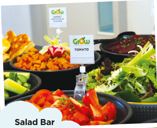
Salad Bar Selection of fresh salad items